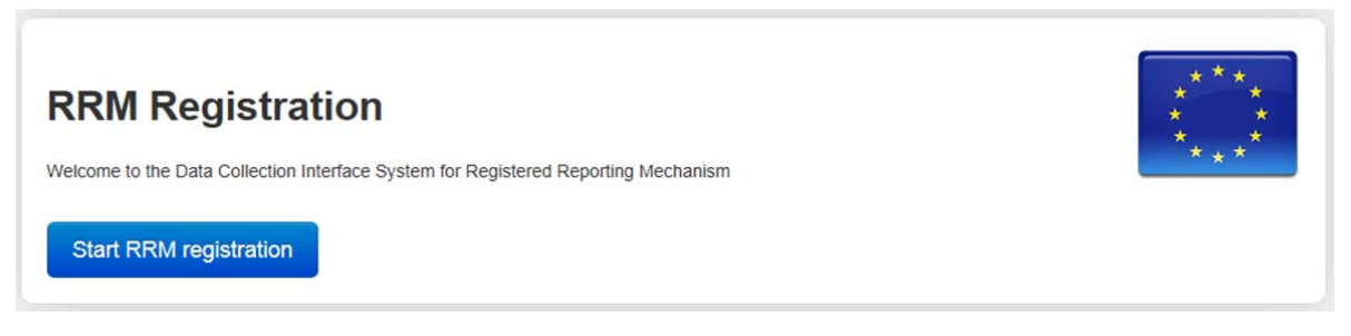
Figure 1: Third Party RRM Registration

Then click on the button "Start RRM Registration", as depicted in the following picture: